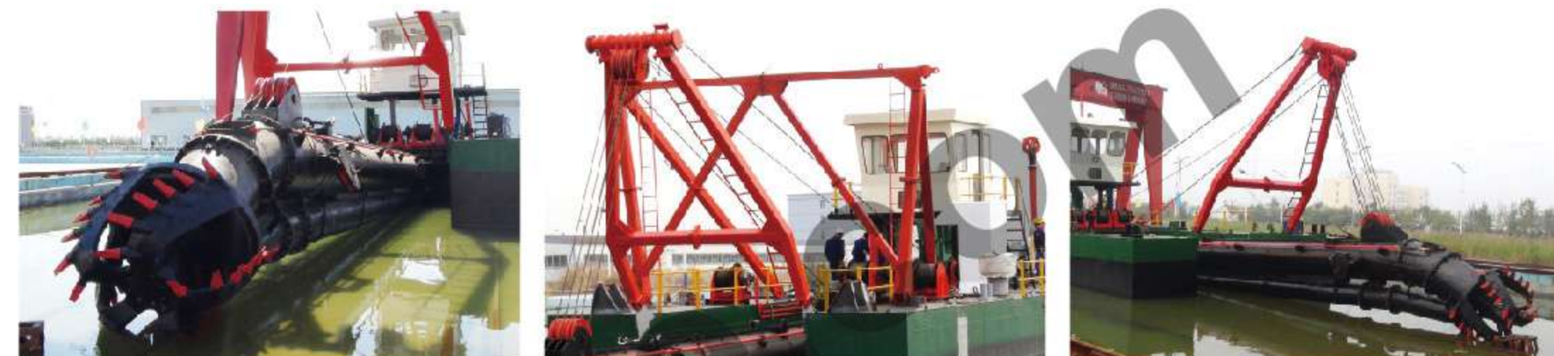
IT200 (8 inch 800m³/h)